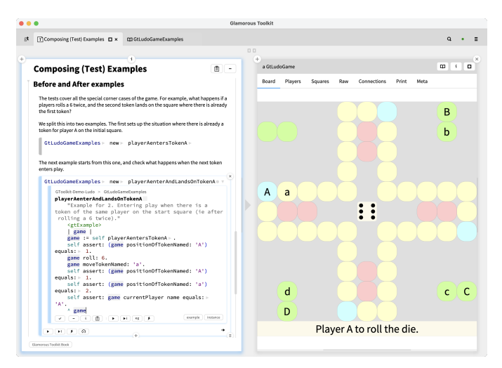
Fig. 2. Explaining a scenario by composing examples that illustrate steps in a computation

Whereas live interactions and playground queries provide a way to navigate through a web of connected objects, custom views do the opposite! Each custom view consists of (i) an encapsulated query, to produce the object(s) of the view, and (ii) a simple, interactive visualization of the result. Thus, the point of custom views is to enable developers to quickly find answers to common questions just by selecting the tab of interest, without having to navigate or code a query (Figure 3).