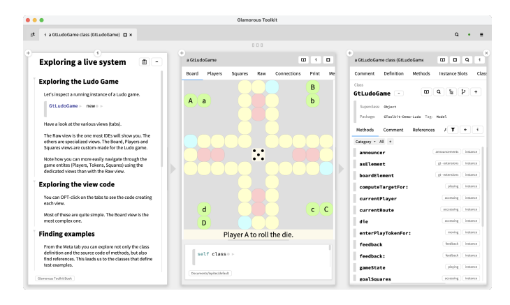
Fig. 1. Navigating from a Lepiter note to a custom view of live instance, and from there to the source code.